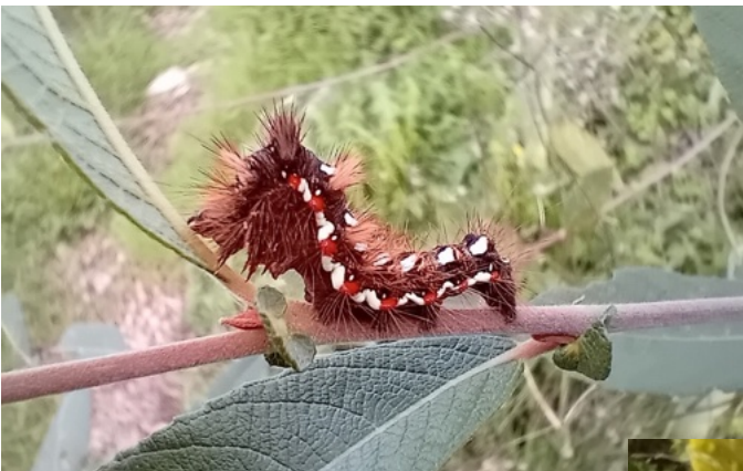
Some of the amazing wildlife diversity found in the tiny Forest.