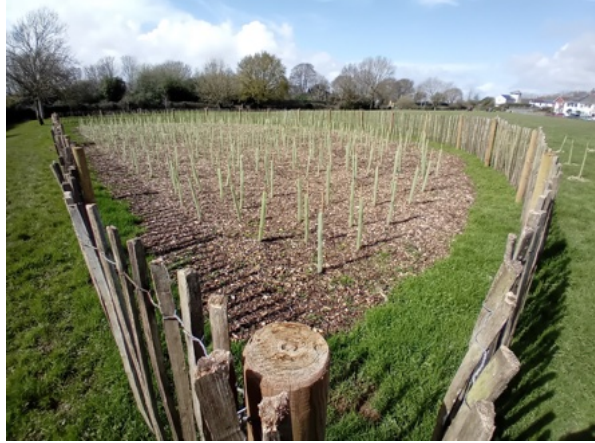
How it started.....